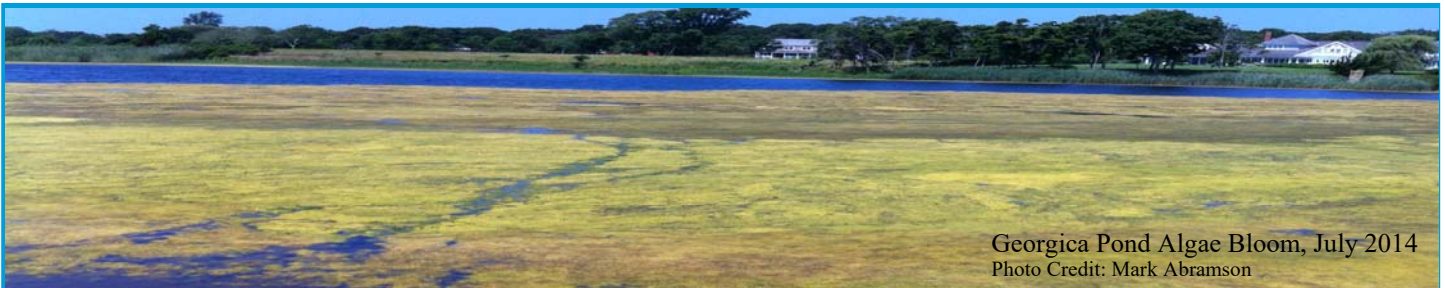
Georgica Pond Algae Bloom, July 2014