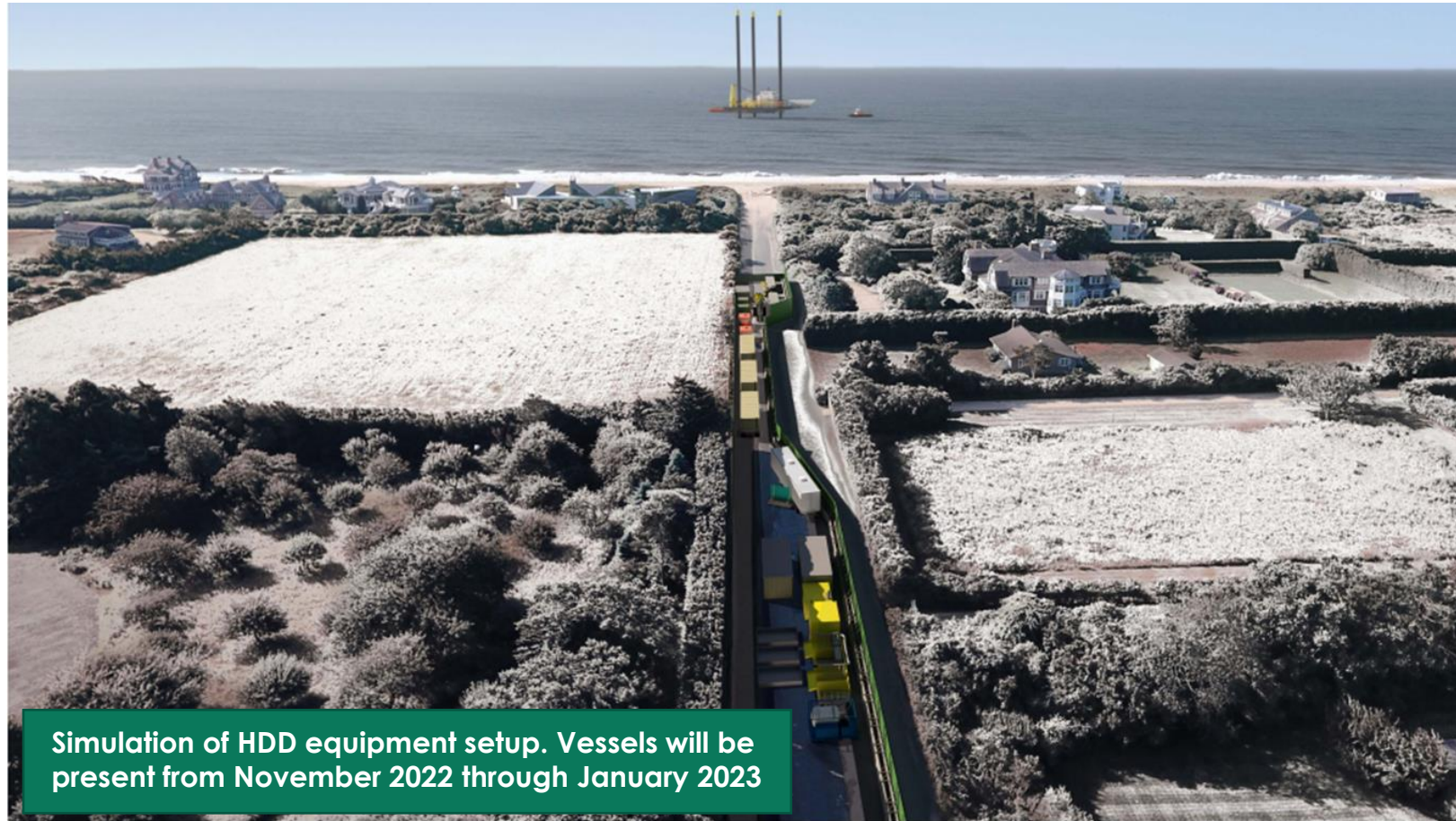
Simulation of HDD equipment setup. Vessels will be present from November 2022 through January 2023