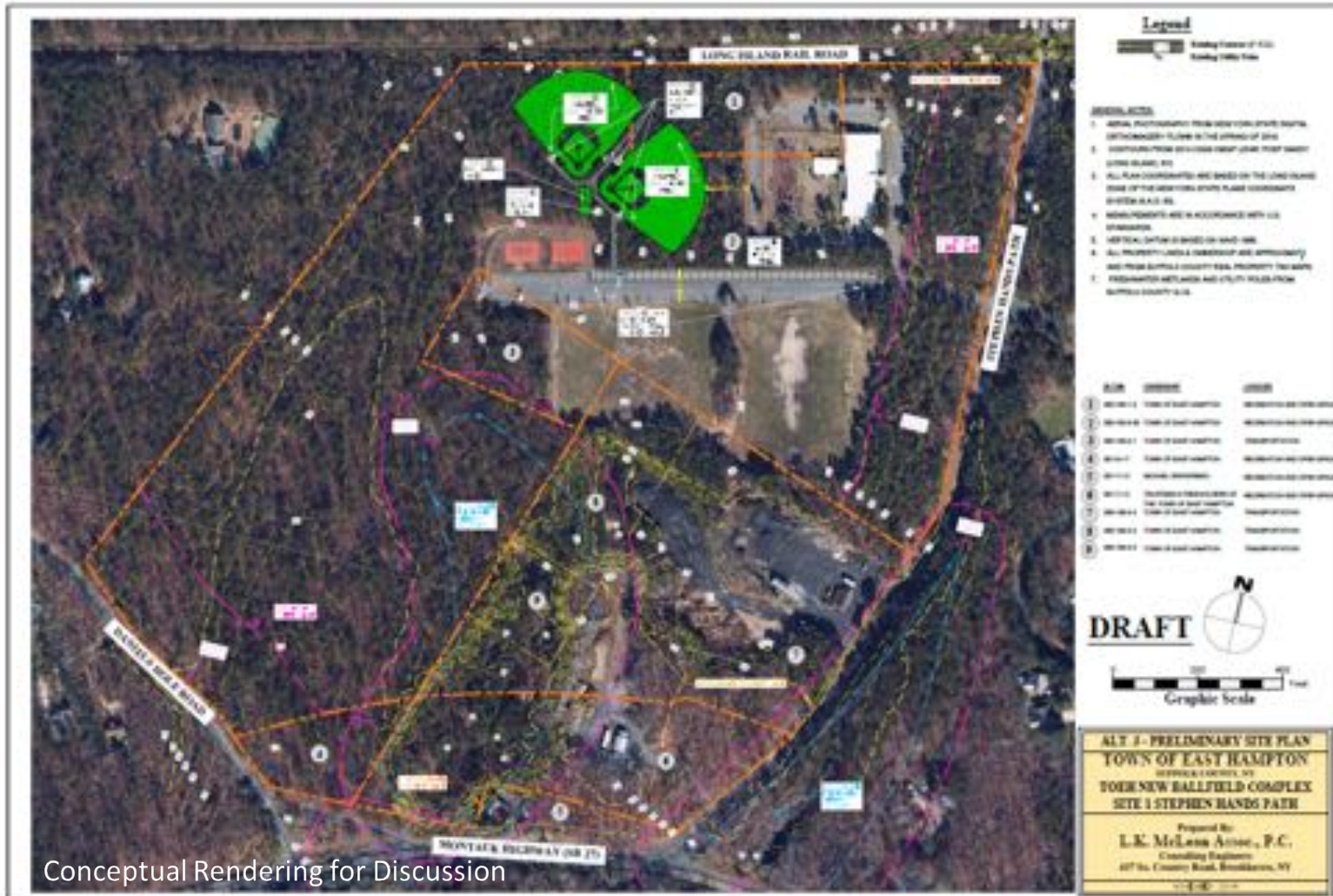
Conceptual Rendering for Discussion